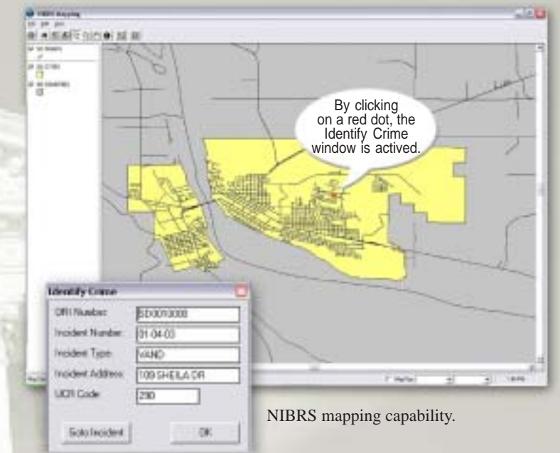
NIBRS mapping capability.